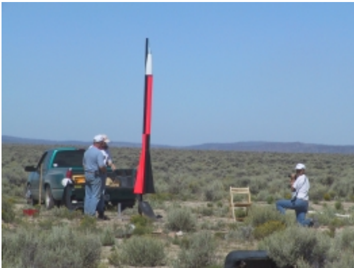
David Proffitt of OREO and Kimberly Harms discuss preparation of David's beautifully finished full scale Asp prior to an "M" flight at Brothers, OR. The boost was beautiful but main deployment was incomplete. The rocket suffered only minor scrapes and scratches, however.