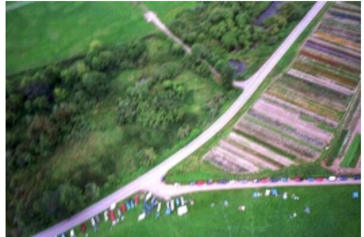
The Monroe flightline seen from Kent Newman's "Snapshot" from 1200'. The flower garden to the North and the main road can be seen as well.

Eric Bloom launched his rocket named Nad Gazeem (yup, that's the name) on an I285 Redline motor. Redline motors may not have the best performance but they sure